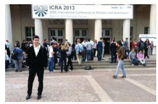
Figure 1. Entrance of the Conference Venue

On 10^{th} of May (Friday), I joined the last day of the conference which was mainly workshops. The one got my attention was "Microassembly: Robotics and Beyond". I listened vey informative talk of experts in the field and did a small presentation about my work again.